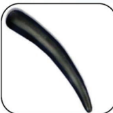
Gua Sha Tools and Sets