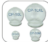
Premium Cupping Sets