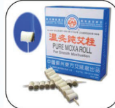
Full Line of Moxas