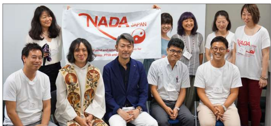
Presenters at the NADA Japan first conference.

perhaps the first well-organized event ever offered for acupuncturists and the general public to come together and learn about the social situation of a world unknown to them – a world where people are suffering from this illness of addiction.