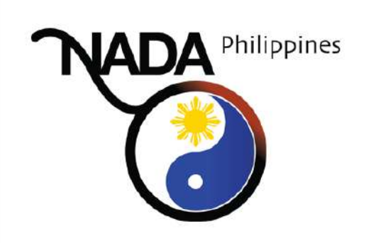
Helping People Help Themselves

When we first arrived at the Holy Angels Parish in Plaridel, Bulacan, we were greeted by women who have lost a loved one. There was little time for introductions